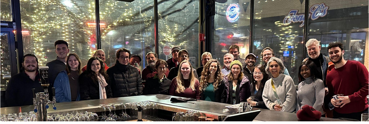
NEURISA Mappy Hour- January 2023

The New England Chapter of URISA (NEURISA) was founded in 1986 as a not-for-profit [501(c)(6)] professional organization incorporated in Massachusetts. NEURISA serves Connecticut, New Hampshire, Maine, Massachusetts, Rhode Island and Vermont. The NEURISA Board is supported by 14 members with varying backgrounds in geospatial services, who volunteer their time to push forward the NEURISA goals.