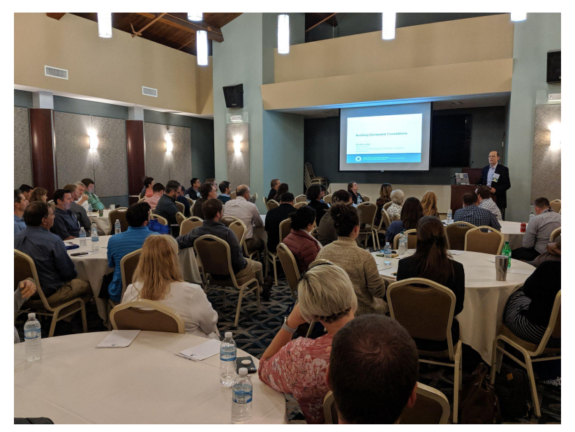
NEURISA Day 2019

Please contact us to sign up for the sponsorship benefit that best fits your organization and we look forward to answering your questions. Thank you for your interest and support!