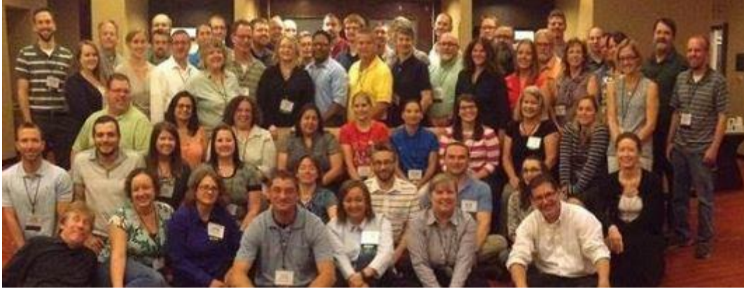
ULA 2016 Class