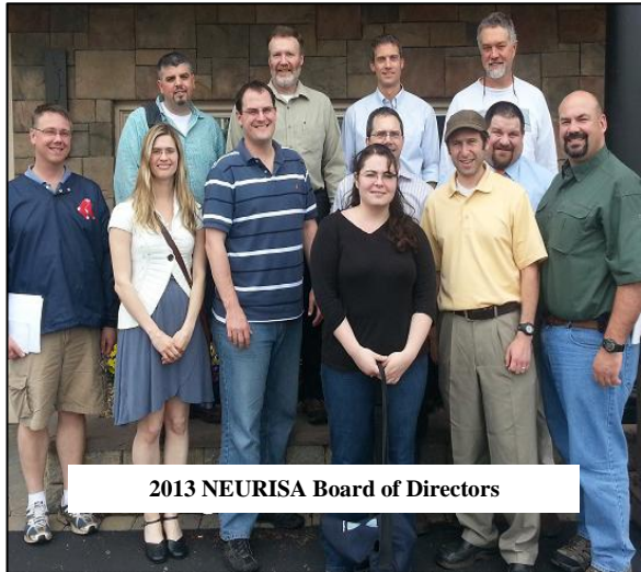
2013 NEURISA Board of Directors