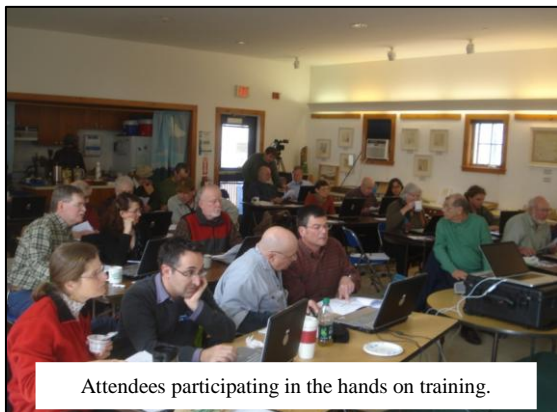
Attendees participating in the hands on training.

http://www.youtube.com/watch?v=IL3jdwspZVA&feature=youtu.be